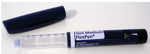
Disposable insulin pen without needle attached

Insulin pens look a lot like writing pens except they contain insulin instead of ink, and they use a needle instead of a pen tip.