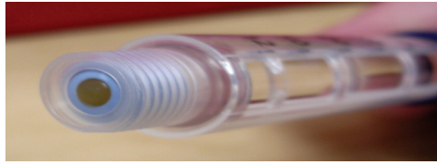
Rubber seal of an insulin pen

Clean the rubber seal with a sterile alcohol wipe before attaching a new needle.