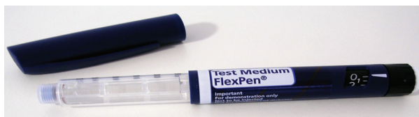
Insulin pen with its cap off