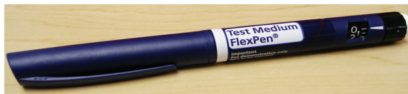
Insulin pen with its cap on

Insulin pens in use must NOT be stored in the refrigerator.