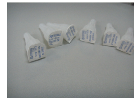
Sterile needles in plastic containers for an insulin pen