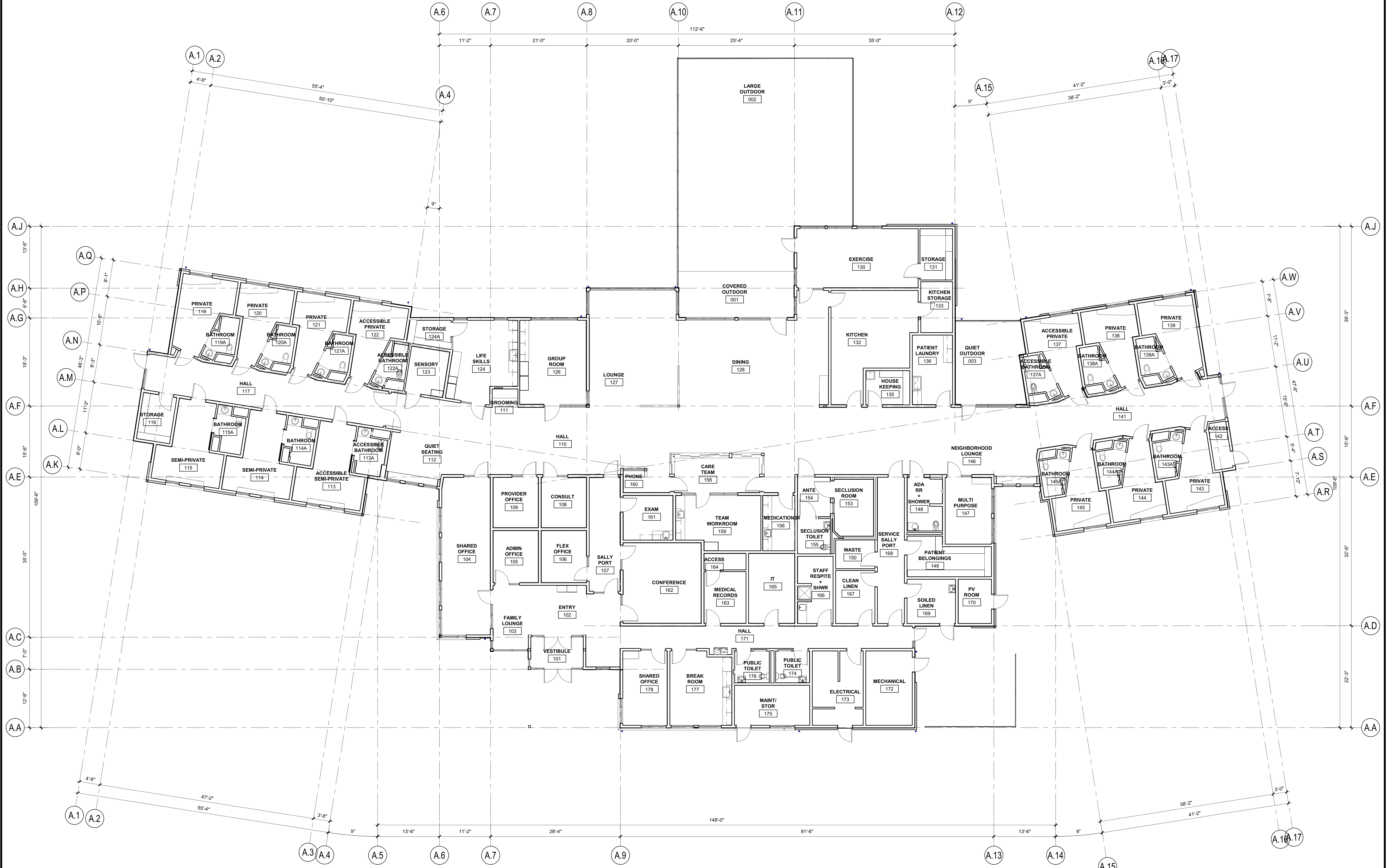
1 FLOOR PLAN 1/8" = 1'-0"