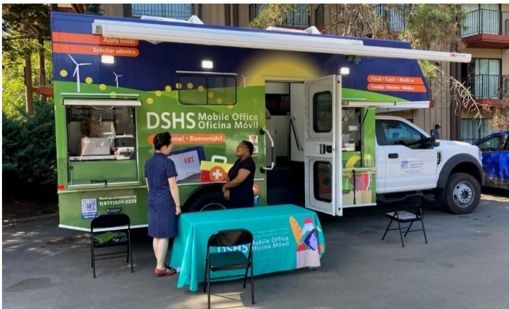
Figure 3: Picture of two women chatting in front of a DSHS Mobile Office at an event for Afghan refugees in August 2023.

Efforts to reach out to the mandated participant category of LEP families included sending letters, preparing flyers, and in-person contact through community-based organizations throughout the state. The final method proved to be the most successful, perhaps due to bonds of trust between CBOs and LEPs in contrast with the general lack of trust LEPs have in government.